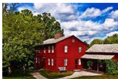
Fruitlands Museum, Harvard, MA

Passes to the featured museums and others are available at the Reference Desk or by calling 508-210-5569.