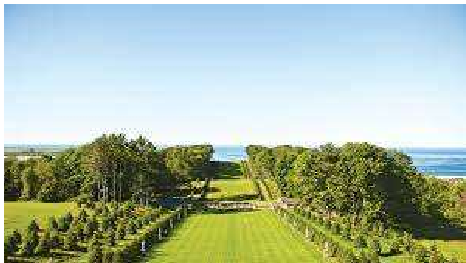
The Grand Allee at Castle Hill on the Crane Estate, Ipswich, MA

One of the latest additions to our pass program at the Gale Free Library, The Trustees of Reservations is not one museum or location, but many! The Trustees care for more than 100 properties on roughly 47,000 acres in Massachusetts. Our Trustees GO Pass admits patrons at the Family Membership Level--free or reduced admission for 2 adults and children under 18--to Trustee properties throughout Massachusetts, including Fruitlands Museum in Harvard, Castle Hill on the Crane Estate in Ipswich, deCordova Sculpture Park and Museum in Lincoln, and Naumkeag in Stockbridge! See The Trustees website ( thetrustees.org ) for a complete listing, or pick up a property map and pass at the Reference Desk.