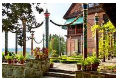
Naumkeag, Stockbridge, MA

One of the latest additions to our pass program at the Gale Free Library, The Trustees of Reservations is not one museum or location, but many! The Trustees care for more than 100 properties on roughly 47,000 acres in Massachusetts. Our Trustees GO Pass admits patrons at the Family Membership Level--free or reduced admission for 2 adults and children under 18--to Trustee properties throughout Massachusetts, including Fruitlands Museum in Harvard, Castle Hill on the Crane Estate in Ipswich, deCordova Sculpture Park and Museum in Lincoln, and Naumkeag in Stockbridge! See The Trustees website ( thetrustees.org ) for a complete listing, or pick up a property map and pass at the Reference Desk.