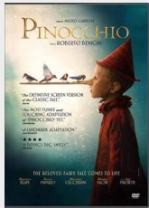
Guillermo Del Toro's Pinocchio PG--2022