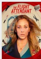
The Flight Attendant Seasons 1 & 2 2020-2022 For mature audiences.