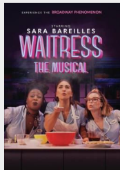
Waitress : The Musical (from the Broadway play) NR--2023

Drama--a true story about hope and kindness.