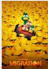
Migration PG--2023 Animated