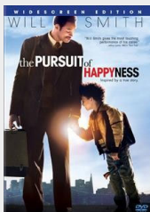
The Pursuit of Happyness PG-13--2006