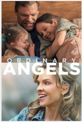
Ordinary Angels PG--2024

Drama--a true story about hope and kindness.