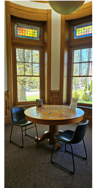
New furniture installed in the Reading Room and Secret Stairs nook last month improves seating options and allows for the return of the puzzle table on the Library's first floor.