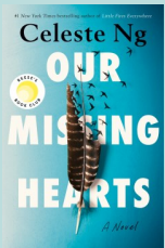
Our Missing Hearts By Celeste Ng